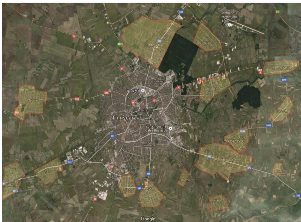
Fig.1 The map of Timișoara with the marked neighbouring communes